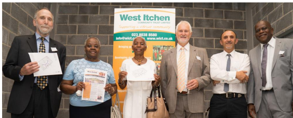
Our Trustees at the opening of Acorn Business Park in September 2016